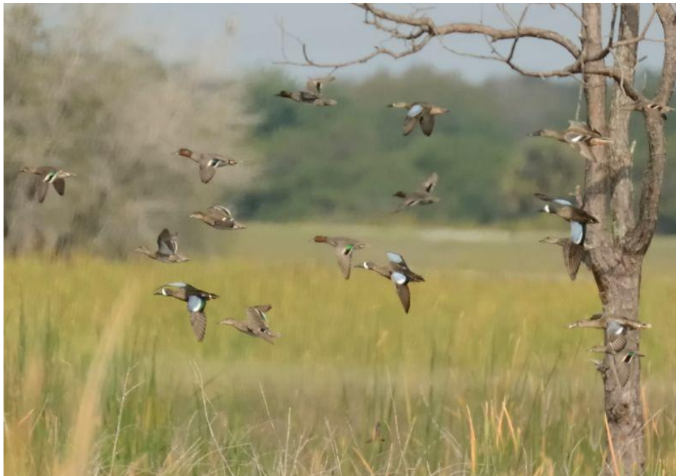
Blue-winged-Teals from the Lakeside Ranch STA field trip.

Mark the full moons on your calendars and be ready to have a "hooting" good time birding for owls.