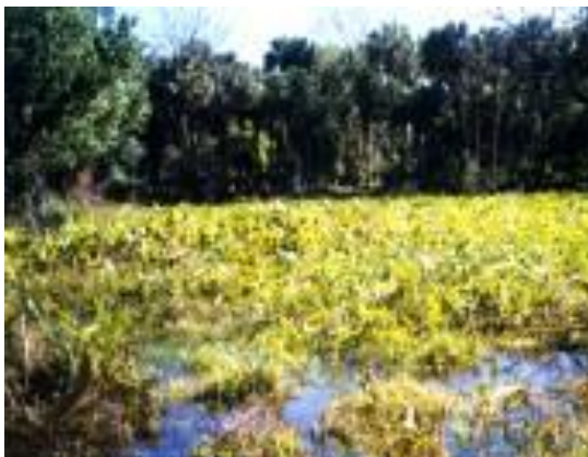
Paleo Hammock Preserve

Let's do some birding right here in St. Lucie County! These are natural areas great for birding and photography. We will be walking grass and dirt trails that are sometimes wet and muddy and uneven, so dress accordingly.