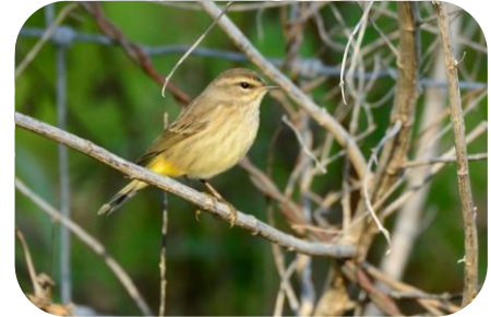
Palm Warbler in Winter Plumage

First, Palm Warblers are tail-bobbers; their tails pump up-and-down almost constantly. Second, these warblers have yellow undertail coverts. That means the feathers underneath the tail near the body are yellow. The yellow color can sometimes extend up to the belly. Finally, you often find Palm Warblers foraging for insects on the ground in open areas like parks or your lawn. So, now I am sure you can identify at least one of Florida's "confusing fall warblers!"