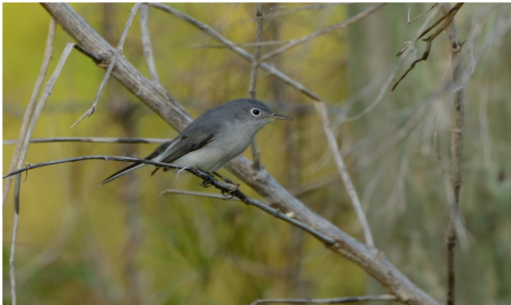
A Blue-gray Gnatcatcher from the Christmas Bird Count.

Mark the full moons on your calendars and be ready to have a "hooting" good time birding for owls.