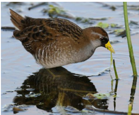
Sora