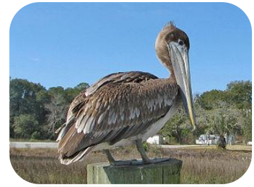
Juvenile Brown Pelican

unprotected bones can become snagged in pelicans' pouches, causing punctures and tears along with pain and debilitation. When Brown Pelicans "steal" bait from line fisherman and are caught on the hook, encourage fishermen to reel in the bird and remove the hook like they would from a catch-and-release fish instead of simply cutting the line. Cutting the line without removing the hook condemns the bird to pain, line entanglement, and eventual death by starvation or strangulation. Call a wildlife rehabilitator if you see a pelican in distress.