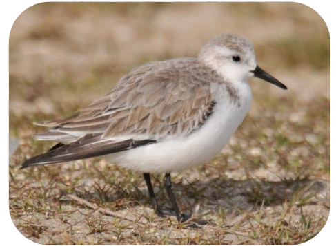
Sanderling in winter plumage.

Sanderlings are small birds with a white face, black bill and legs, white belly, and pale nonbreeding plumage. In flight, Sanderlings display a prominent white stripe on their greater coverts. So, this winter, visit our local beaches and amuse yourself watching the Sanderlings run. Good birding!